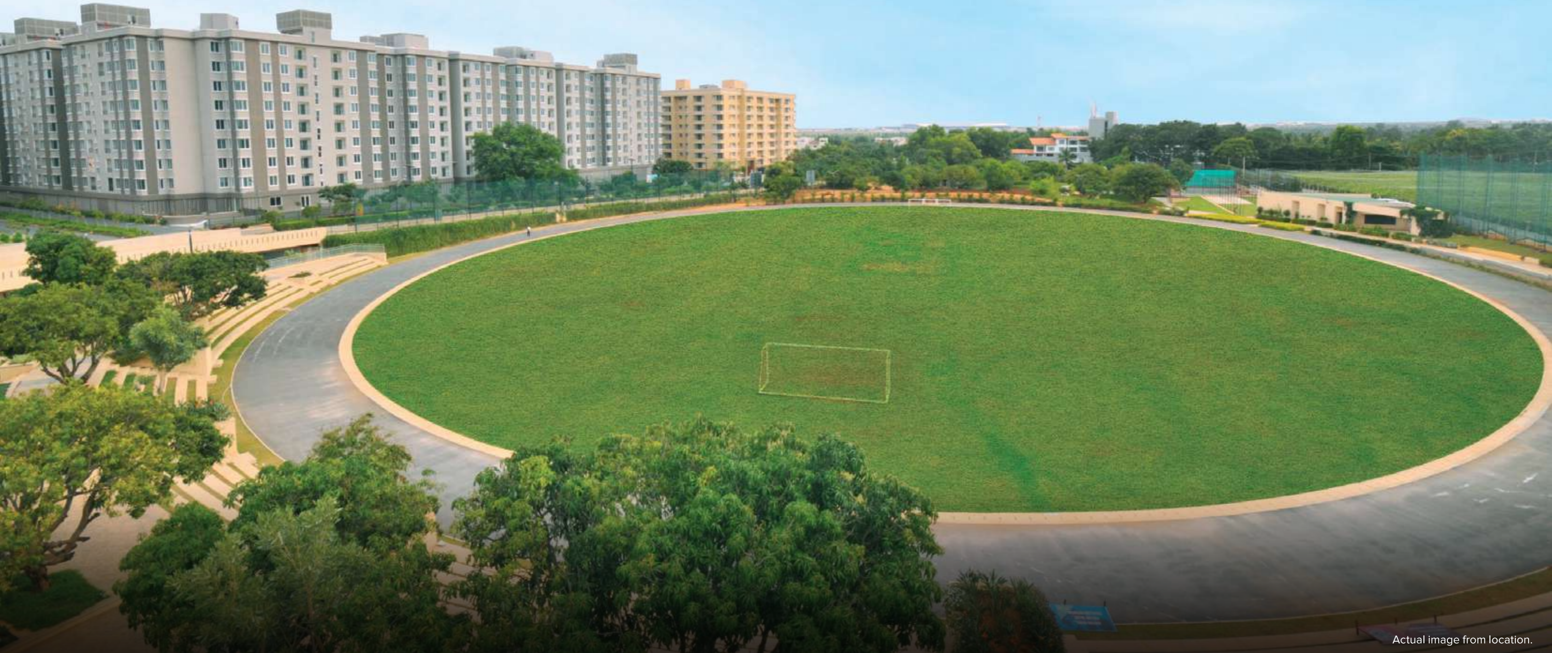
Actual image from location.